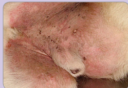
Red skin (Erythema)