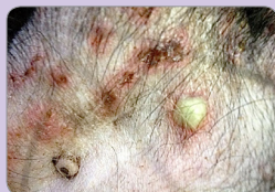
Secondary bacterial infection (pyoderma)