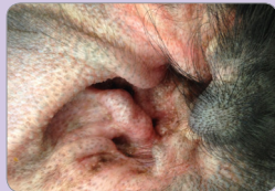
Ear infection (Otitis Externa)