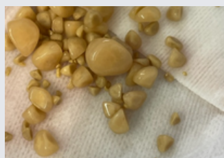
Above: crystals under the microscope